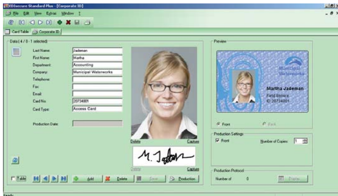
EDIsecure® CMS Standard Plus