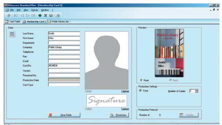
EDIsecure® CMS Standard Plus